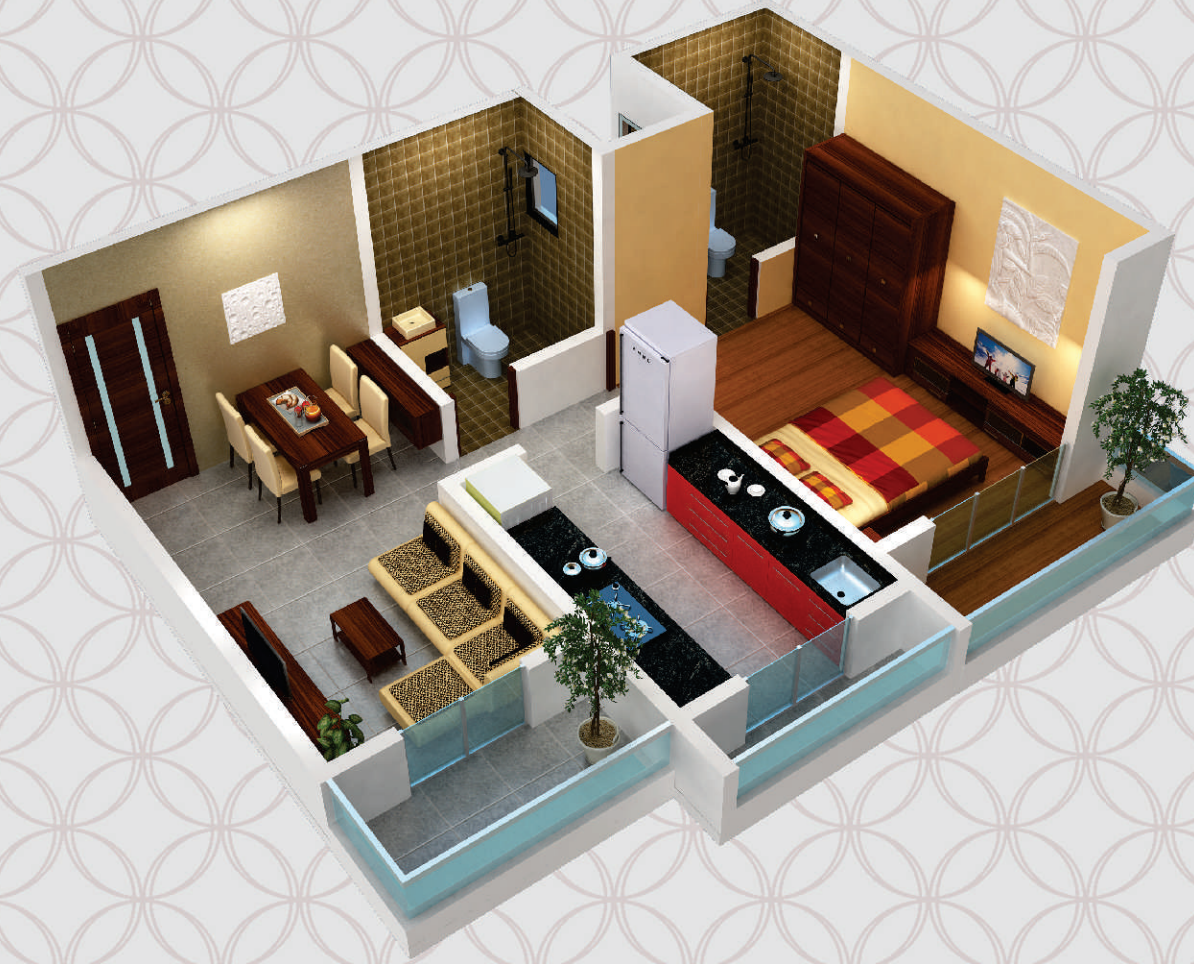
3D SAMPLE FLAT