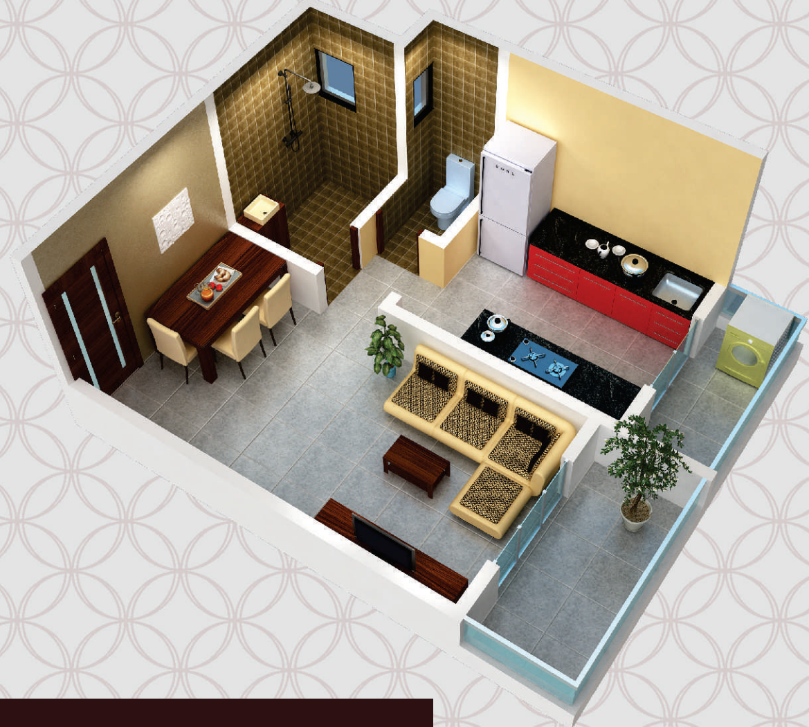
3D SAMPLE FLAT